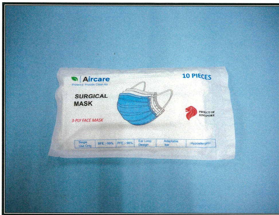
Photograph 1 Granzilla Aircare 3 ply disposable face mask (Black/White) as received