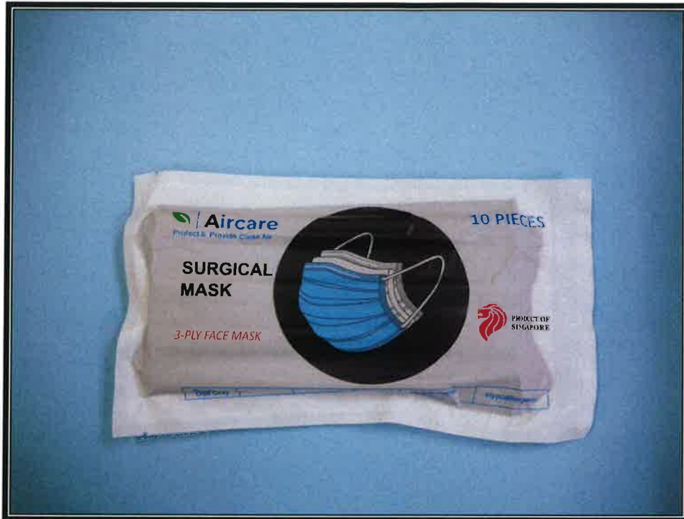
Photograph 1 Granzilla Aircare 3 ply disposable face mask (Black) as received